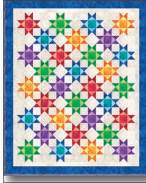
Star Struck made with Hourglass Units