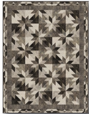
Random Stars made with Hunter's Star Blocks