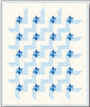
Ribbons and Stars made with 6-Point Stars and HSTs